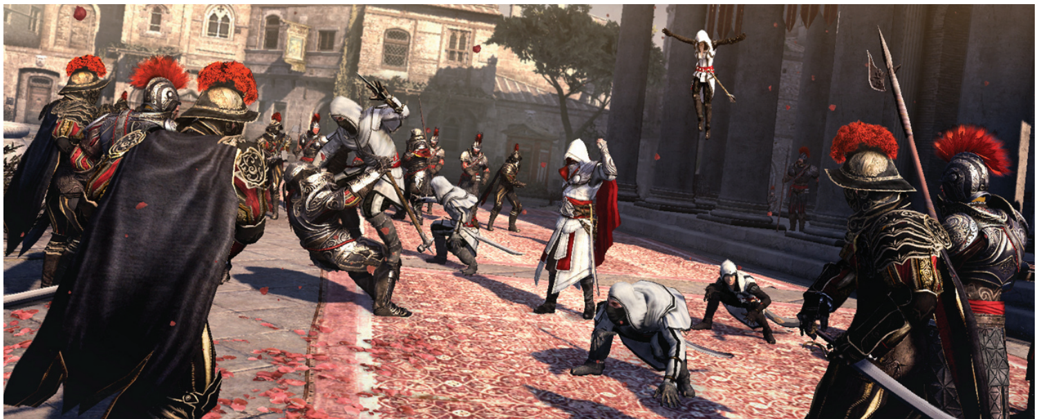
Assassin's Creed Brotherhood.