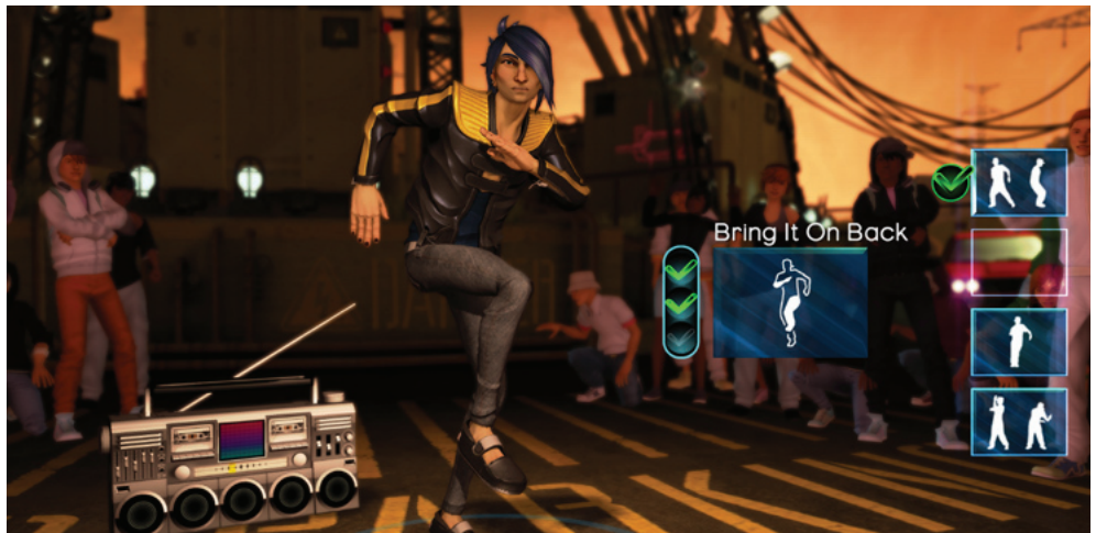
Dance Central.